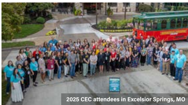
2025 CEC attendees in Excelsior Springs, MO

The 2025 Connecting Entrepreneurial Communities (CEC) Conference held in Excelsior Springs, Missouri demonstrated significant reach and influence across Missouri and neighboring states, reinforcing its role as a cornerstone convening for entrepreneurial ecosystem builders. Preconference registration data reflects participation from 46 unique Missouri counties, with strong representation from Clay, Boone, and Jackson counties, underscoring both geographic diversity and concentrated engagement in key regions. Attendees represented 94 unique ZIP codes, with 86% based in Missouri and 14% from out of state, illustrating the conference’s expanding regional pull.